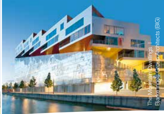
The Mountain Dwellings 1 Blake Ingels Group Architects (BIG)